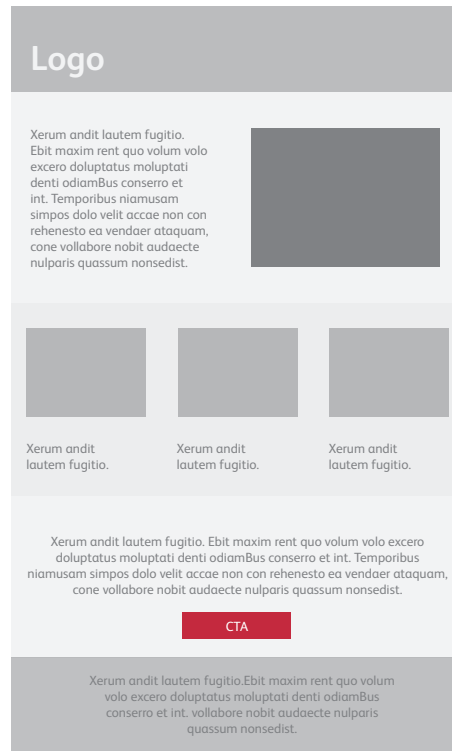
Correct example on desktop